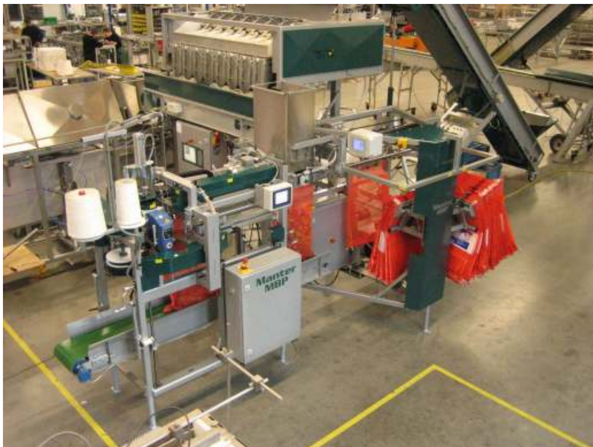
SAB (semi automatic) with MBP